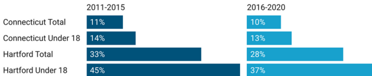
Chart: CTData Collaborative • Source: US Census • Created with Datawrapper

Hartford neighborhoods have varying percentages of children that live in poverty. Blue Hills stands at about 9%, and Clay Arsenal stands at 67%, being the highest and the lowest percentages, respectively.