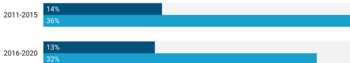
Chart: CT Data Collaborative • Created with Datawrapper

These charts account for single parents in the state of Connecticut and the City of Hartford that have their own children and have never been married, widowed or divorced.