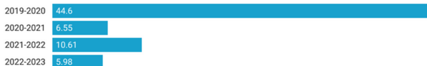
Chart: CT Data Collaborative • Source: Connecticut State Department of Education • Created with Datawrapper

The US Department of Education administers the Free Application for Federal Student Aid (FAFSA). Students complete the FAFSA to apply for federal financial aid, including grants, loans, and work-study opportunities. The CT State Department of Education stresses the importance of the FAFSA and hosts special events, such as statewide challenges to motivate students to complete the FAFSA. Despite these incentives, the FAFSA completion rate for Hartford students has been very low over the years and has worsened with the pandemic. The low completion rates indicate that Hartford high school students may not receive an adequate amount of financial aid from prospective colleges which contributes to Hartford students being less likely to enroll and persist in college.